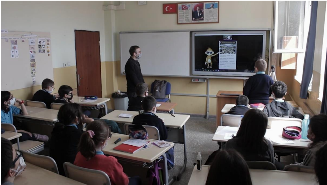
Figure 1. A moment from the intervention with the APA collaborating with the teacher

Overall, the intervention with APA went without any major issues and the planned script was followed as planned. However, on a few occasions, the teacher needed to ask students and/or the APA to speak again as the audio was not clear in one of the two stations. After the formative assessment was delivered by the APA, the teacher asked the students to complete the follow-up activity, which included five questions covering the objectives from the five units (see Appendix 4). The objectives of the activity were similar in both the Padlet assignment, and the follow-up activity. The difference between the Padlet and the follow-up activity was that in the latter, the students completed the task in the classroom and on paper. The time allocated for the follow-up activity was 10 minutes. After the follow-up activity, a motivation questionnaire consisting of six questions on a 5 Likert scale was handed out to the students to fill in (see Appendix 5). 5 minutes were allowed for completion of the questionnaire.