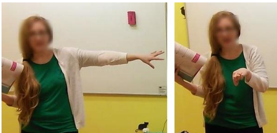
Image 4 - illustrative gestures - unspecific and specific past

T1 is visual in his own right, as he explains how the lesson will be structured. He shows the students with his fingers how many games they are going to be playing and then explains the games pointing to those very fingers. He also keeps a keen eye on how the students are paying attention and nods as he receives excited feedback. When he recommends the students read for fun he mentions an author he enjoyed as a young boy. “The school has a collection of books by Roald Dahl”. Through gestures he illustrates a box and then he places the ‘books’ into it.