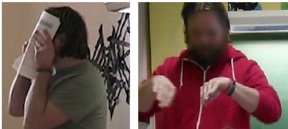
Image 2 - humor - class room maintenance

adult acting silly and they are immediately back focusing on the task at hand. In Image 2, T1 can also be seen showing the students the hand gesture that asks them to circle back and focus on the task at hand. In addition to this technique being in classroom maintenance to keep students engaged, it also allows the students non-verbal messaging they are familiar with in order to create a comfortable environment for the students.