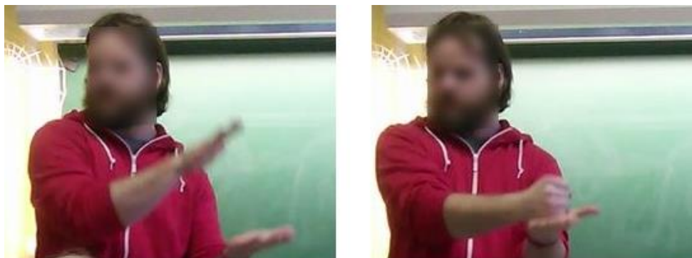
Image 5 - illustrative gestures - applying for a patent

As with immersion education and its emphasis on negotiation of meaning, students are encouraged to use all the communicative tools at their disposal. One of the goals for the students' communicative skills is to support both verbal and non-verbal communication in the hopes of reaching understanding between the people communicating. T1 does this especially with his younger students who have a slightly weaker skill level of English than his other group. As it is a negotiation of meaning student contribution is important for the teacher's message and feedback. For instance one of the students is asked to explain 'tombstone', which she does by gesturing the earth and saying "when they put the person inside. They put the stone on top", also gesturing the tombstone with her hands. T1 is satisfied and sees that the student has reached an understanding of the vocabulary. As depicted in Image 6, T1 then repeats the student's explanation mimicking her non-verbal communication and adding key vocabulary in the verbal message. "When a person dies, they are put in the earth, yes, and the tombstone goes on top of the grave." In this way T1 is not only using non-verbal communication as a technique to support student understanding, but encouraging the students to use gestures and non-verbal techniques along with their message. The objectives of negotiation of meaning are therefore met when students receive feedback and encouragement on their message.