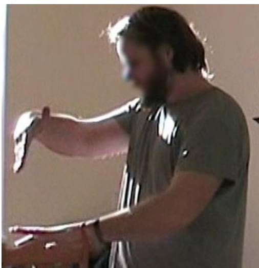
Image 6 - illustrative gestures - tombstone