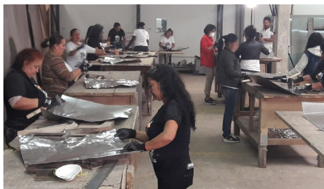
Image 2 Women forging the molds of the tiles.

When we melt down the metal, and then we made ‘boom boom’ noises, which sounded like gunshots, the first thing we felt was anger, and we started to hit that again, really hard, and we worked fast (...) Hammer strokes full of anger and fury, for myself, for the others. Hammering out my own story and that of the others because I have listened to the stories of other women victims. (...) One begins to throw out the venom as if to release the anger, and all the thoughts of what happened come to one, then one hits and hits, and when one begins to unload the force, one rests. For every hammering that I gave, I threw away all those memories”. Civil Victims of Colombian Conflict, in Fragmentos , the short film. (2020: 18’00)