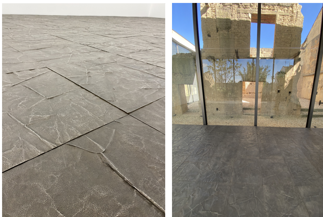
Image 3,4 Photos of the counter-monument inside. 2024

deep feelings but also opened a new path that today, according to Gamboa, continues to be built. They now represent the ‘turning watchers into doers’ of activism fundamentals, leading new dialogues around the rights of victims and becoming artists who fulfill the action of guiding, building a community in order to continue the process of healing and transformation of war wounds.