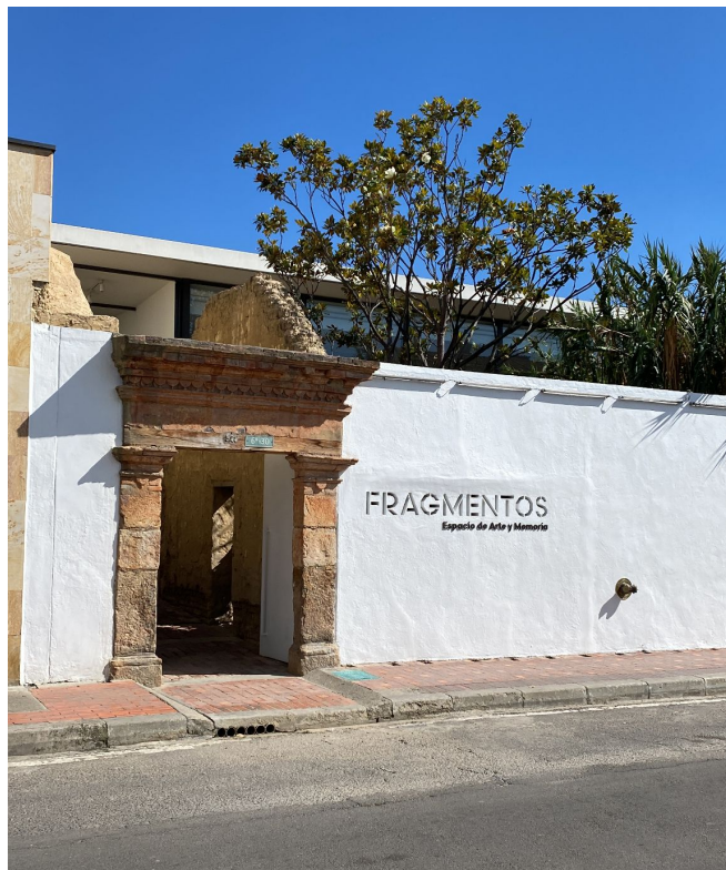
Image 1. Entrance of the exhibition. January 2024

After a five-decade-long war, Colombia reached a historic turning point in 2016 with the signing of a groundbreaking peace agreement. This moment marked the nation's resilience, symbolizing a shared determination to break free from the cycle of violence. During the signing ceremony, representatives from the Colombian government and the Revolutionary Armed Forces of Colombia (FARC EP) convened to ratify the agreement officially; a particularly impactful moment unfolded when members of the FARC EP laid down their firearms, a compelling and symbolic gesture marking a significant ceasefire. The weapons, once tools of war, were turned into symbols of peace. Instead of disappearing, they took on a new life as a unique form of artistic expression. 'Fragmentos' (Fragments) (2017), by Doris Salcedo, a renowned Colombian artist known for her work in sculpture and