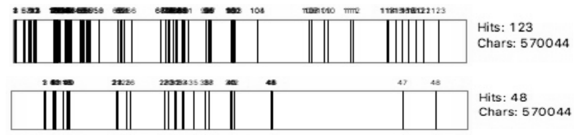
Chart 4. Appearance of the keywords 'Maskhadov' (above) and 'opposition' (below) in the second year of the sample.