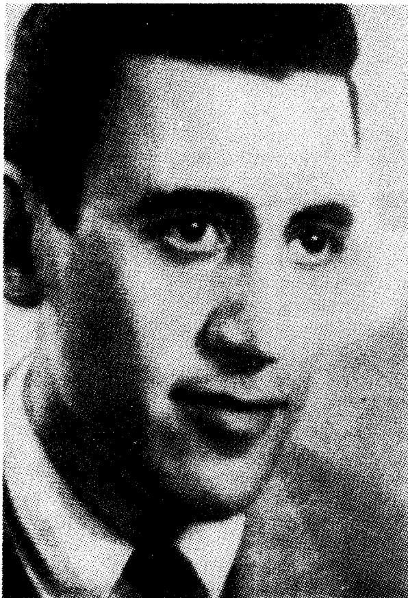
JEROME DAVID SALINGER

"We know the sound of two hands clapping. But what is the sound of one hand clapping?"