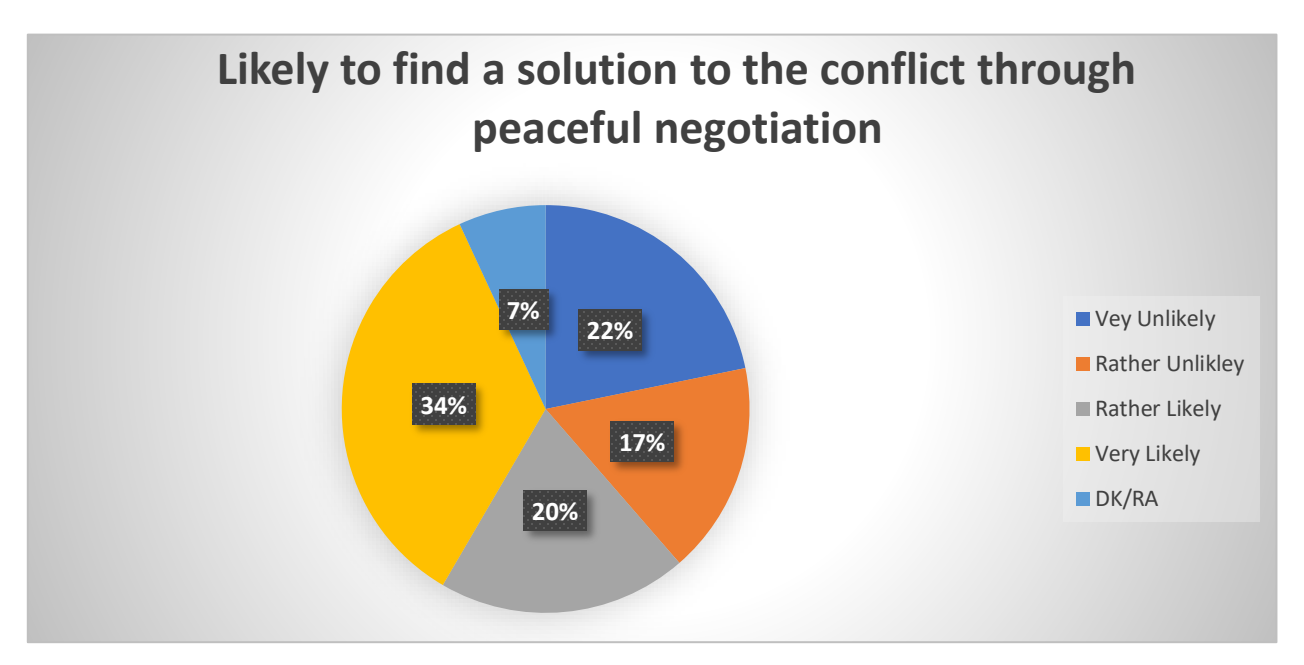
Figure 3: Caucasus Barometer, Azerbaijan, November 5, 2013, to December 14, 2013, (Caucasus Barometer is the annual household survey about social economic issues and political attitudes conducted by CRRC)