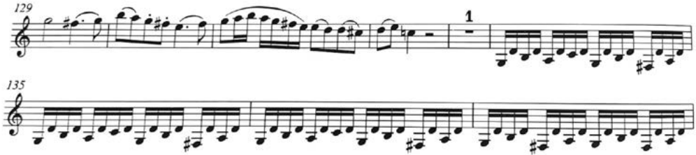
Example 9. Wolfgang Amadeus Mozart, Clarinet Concerto K622, I movement, bars 129–137. 22

lower register too aggressive and “biting” for the piece. The audio example in this instance has been recorded only on the modern clarinet in A, because the historical clarinet is in B flat.