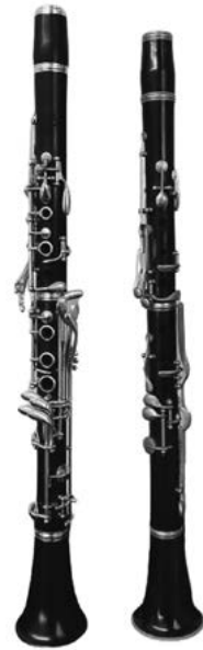
Figure 1. Left: modern clarinet; right: Müller clarinet. Notice the slight difference in size.

In terms of a direct physical comparison between the two, it is easy to see from Figure 1 that the modern clarinet is slightly longer and larger. The tone holes, as well, are larger on the modern clarinet. The higher number of keys makes the instrument heavier, which affects some aspects of my playing (see section 4.2). It also took some time to get used to the different fingerings. Aside from the differences in size and keys, I kept reporting during the practice sessions that the historical clarinet felt more “alive” in my hands, like a creature I had to try to control, but would try to have its way. Antony Pay, an outstanding British clarinetist, describes a similar feeling when recalling his first approach with the clarinet as a child: “When we begin to play, we do think of the clarinet very much as an object [...]. It is an object we must try to persuade to do what we want it to, and which often seems to resist us. So we are in the business