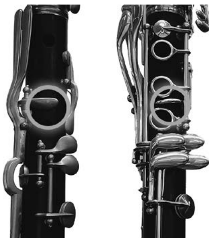
Figure 2. Left, in the circle, key for B flat / F. Right, in the circle: key for B / F sharp. The scope of the key changed with the addition of the metal rings.

It is undeniably more complicated to master technical passages, especially having in mind the kind of speed and virtuosity taken for granted in the contemporary taste (for more on speed tendencies as registered in popular music, see Léveillé Gauvin 2017). Regardless, much to my surprise, after a few intense practice sessions, I found myself writing the following thought: "I started convinced that the period clarinet was a 'less developed' instrument. Like a child