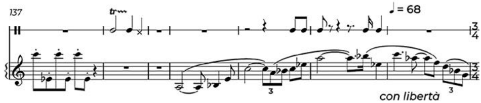
Example 12. A new theme from bar 140. The tambourine covers uncomfortable passages. 26

covering – or rather adding musical material – to the alleged “mistake”. The piece closes with an eye to the past and one to the future: a chromatic scale from the lowest note to written G6, as an homage to Iwan Müller’s invention of an omnitonique instrument, and a long multiphonic.