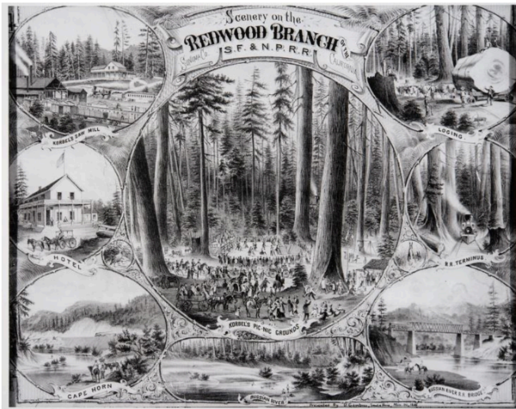
Figure 1: A lithograph promoting the Redwood Branch of the San Francisco and North Pacific Railroad

onymous trees and the river are still prominent attractions in this region today, so is Korbel, not for its role in the logging industry, but for its highly renowned sparkling wine.