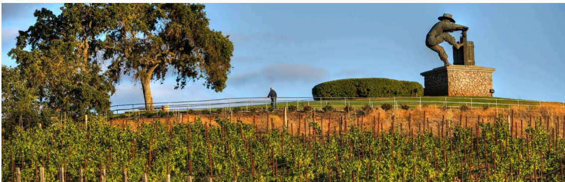
Figure 9: The Grape Crusher sculpture on the Napa landscape

The prominence of vineyards is not the only visual evidence of placemaking here. Even before the region became known as Wine Country, symbols of viticulture marked the landscape. While a visitor driving through the region through much of the 20th century would see a patchwork of orchards, grazing pastures dotted with cows, and towns they might call ‘quaint’, their attention would likely be drawn toward the flashier symbols of viticulture on the sides of the road. These include one of Napa’s first tasting rooms housed inside a 25,000-gallon wine cask and the now-famed “Welcome to Napa Valley” sign erected by the Napa Valley Vintners in 1949. In 1988, a 15-foot-tall statue, titled the grape crusher, joined these landmarks along the highway marking the Southern entry into the valley, clearly alerting visitors that they were entering wine country. “As the bronze sculpture suggests, this region has built its economy not only on the grapes it presses and ferments but also on the rural landscape that vine production preserves.” (Mohan 2014) These symbolic markers visually reinforced wine as the defining feature of the region, distinguishing viticulture from one form of agriculture among many to the dominant feature by which the landscape itself was identified.