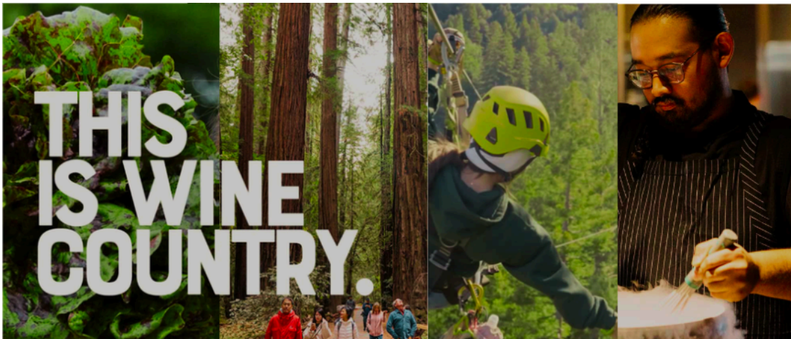
Figure 7: Collage of screenshots of Sonoma County Tourism’s 2025 “This is Wine Country” campaign

Faced with a decline in wine consumption, particularly among young adults, Sonoma County is seeking to diversify its image and appeal. This is made abundantly clear through the county’s tourism board’s campaign “This is Wine Country” which features images of ziplining, redwood hikes, vegetable farms, and fine dining alongside the slogan. Perhaps even more striking is their collaboration with a local craft brewery to produce an ale called “Beer Country.”