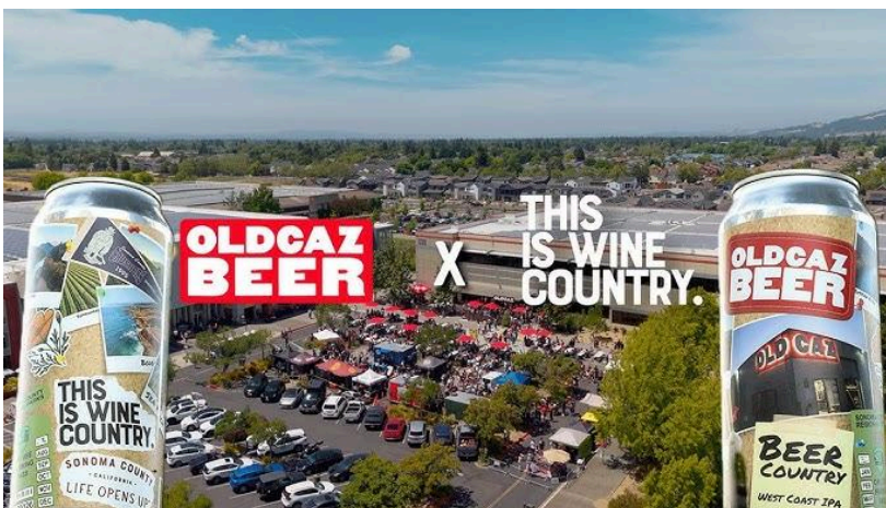
Figure 8: YouTube thumbnail image for Sonoma County Tourism’s video promoting their collaboration with Old Caz Beer “Beer Country”