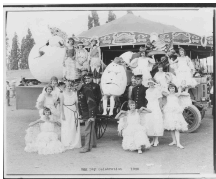
Figures 5 & 6: A flyer for the 1923 Sonoma County Fair and Egg Day produced by the Petaluma Chamber of Commerce (Left), and a photo of Egg Day Celebration in 1920 (Right)