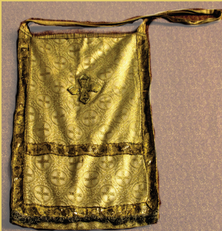
Navedrennik from the period between the two world wars in Church of the Transfiguration of Our Lord in Tallinn