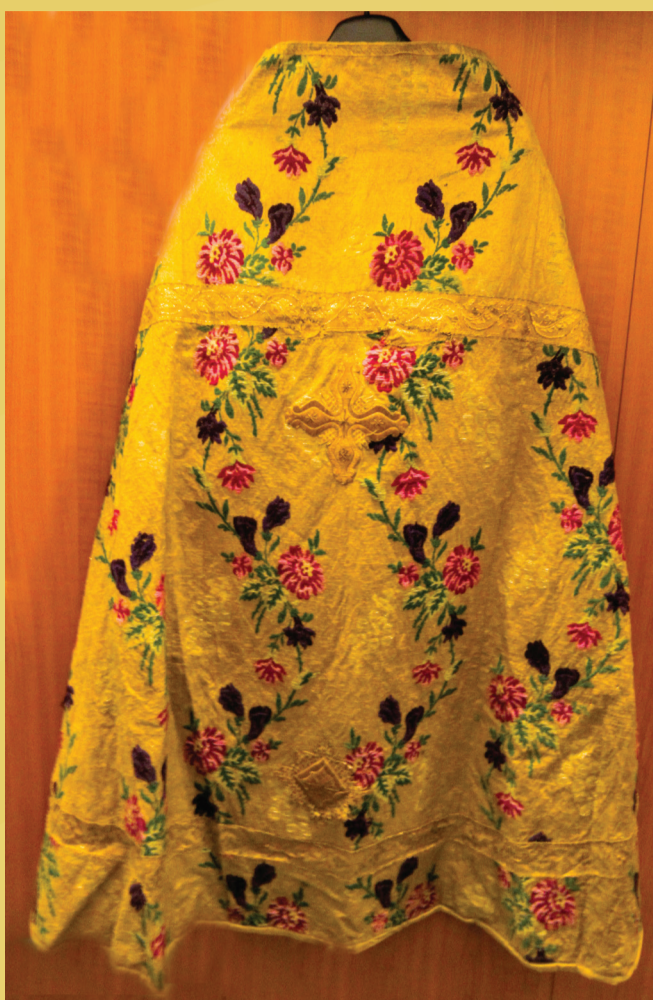
Phelonion from the tsarist period. Aj 355:24 in Valga Museum