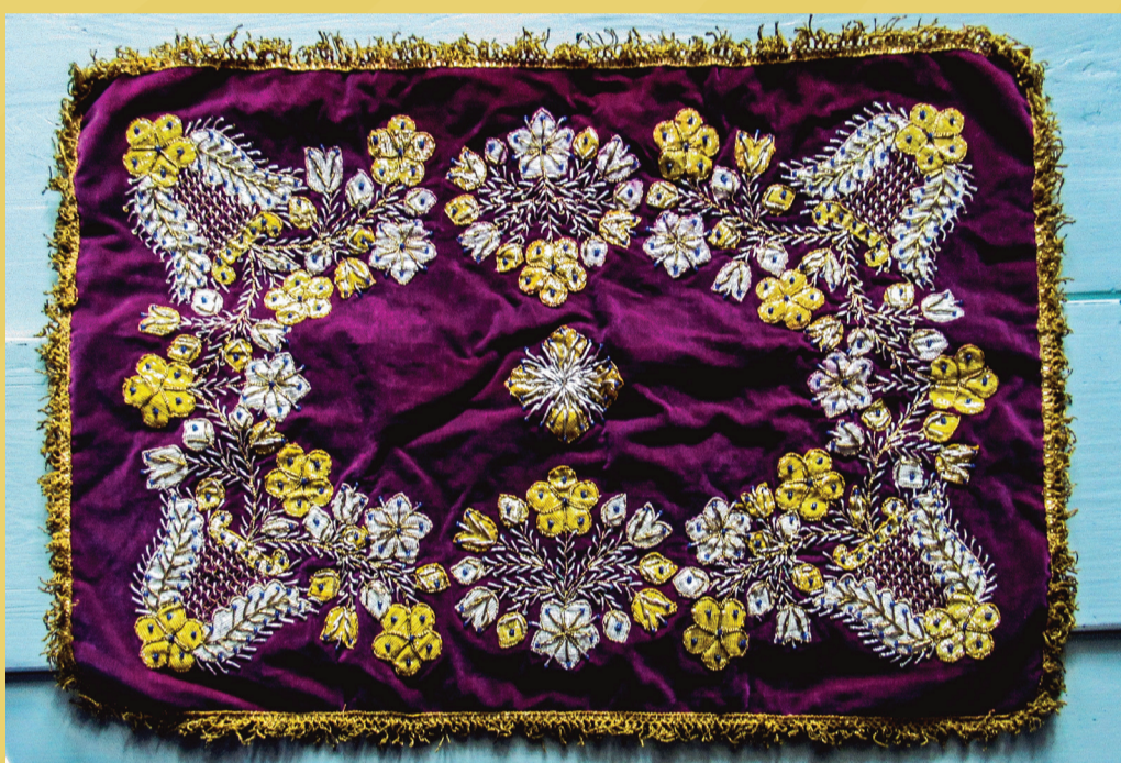
Aer from the tsarist period in Kuressaare Church