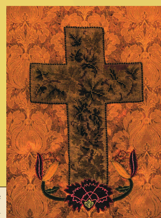
Detail of my own made Altar table covering in Jõõpre Church