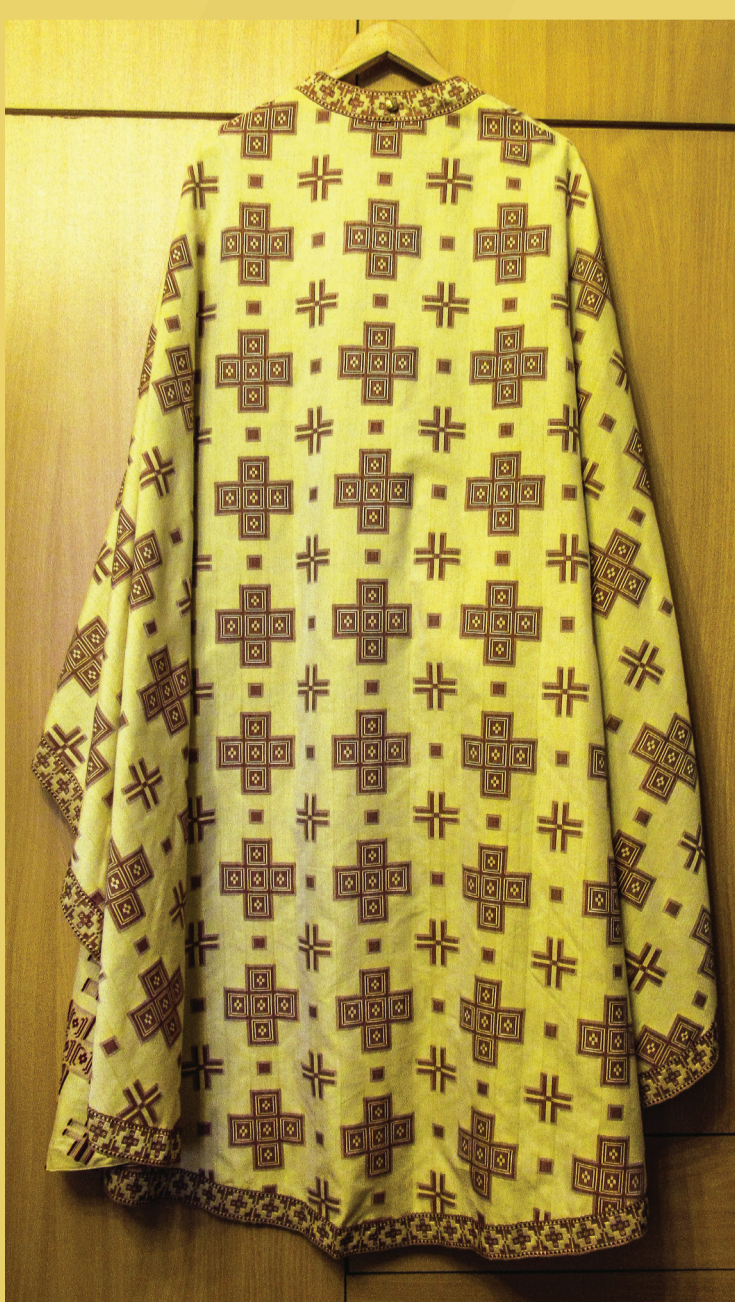
Greek style phelonion fabricated nowadays and used in St. Simeon's and St. Anne's Church in Tallinn