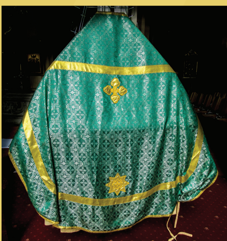
Phelonion from the Soviet period (1980.-es) in Church of the Transfiguration of Our Lord in Tallinn