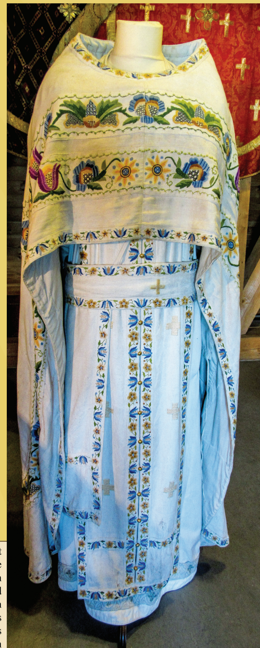
The Set of priest robe from the period between the two world war in Museum of St. Simeon's and St. Anne's Church in Tallinn