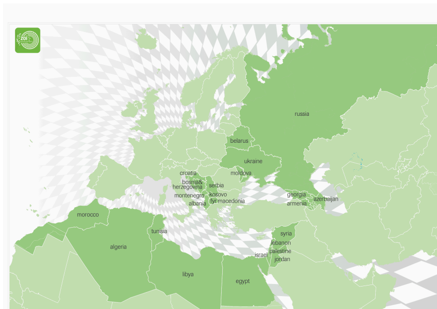
Illustration: Eastern and Southern recipient countries