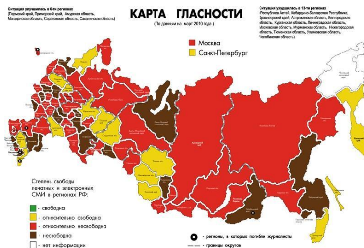
Map 1: Карта Гласности

major national databases on journalist murders elaborated by International Federation of Journalists together with Glasnost Defense Foundation and Centre for Journalism in Extreme Situations grasps the cases according to such characteristics of the murder or other abuses as: ‘homicide’, ‘accident’, ‘crossfire’, ‘terrorist act’, ‘incident not confirmed’, and ‘missing’. 139 This joint database says that 146 journalists have died between 2000 and 2012 all over Russia. 140 The map 1 (in Russian) of Glasnost Foundation shows level of freedom of printed and electronic media in the regions of the Russian Federation by March 2010. According to the map, by that time, situation has been improved in 6 regions and worsened in 13, including the areas where journalists were assassinated. Only few regions were assessed as relatively free, but the majority qualified as relatively restricted or completely not free (e.g. Chechnya).