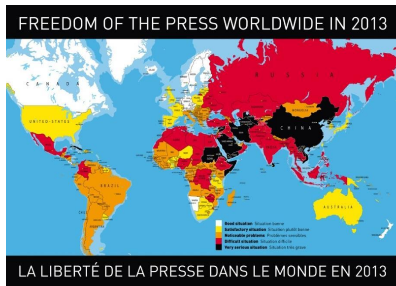
Map 2: Freedom of the press worldwide in 2013

In the rankings of the Paris based NGO Reporters Without Borders , which has been involved in the reporting of violations in media freedom in the world and respected by European intergovernmental organizations, Russia has been fluctuating around the positions with a difficult situation since 2002. Noticeable deterioration in 2006 and 2009 has been changed by slight improvements in recent years. However, the map 2 demonstrates the most recent 2013 global picture of the freedom of press, where index includes pluralism, media independence and transparency. It respectively displays Russian Federation among the troubling states with a “difficult situation” similarly to the previous years. 142